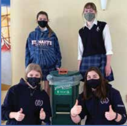
Green Team on the first day of composting

twice the weight of a large motorcycle) of waste from ten collections. The composting program is made possible by support from the Sisters of the Holy Names of Jesus and Mary, Academy Bistro, a grant from Learning for a Sustainable Future, everyone who purchased fundraising items, teacher advisors and the dedication of the Green Team.