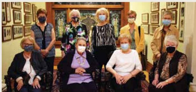
Class of 1960