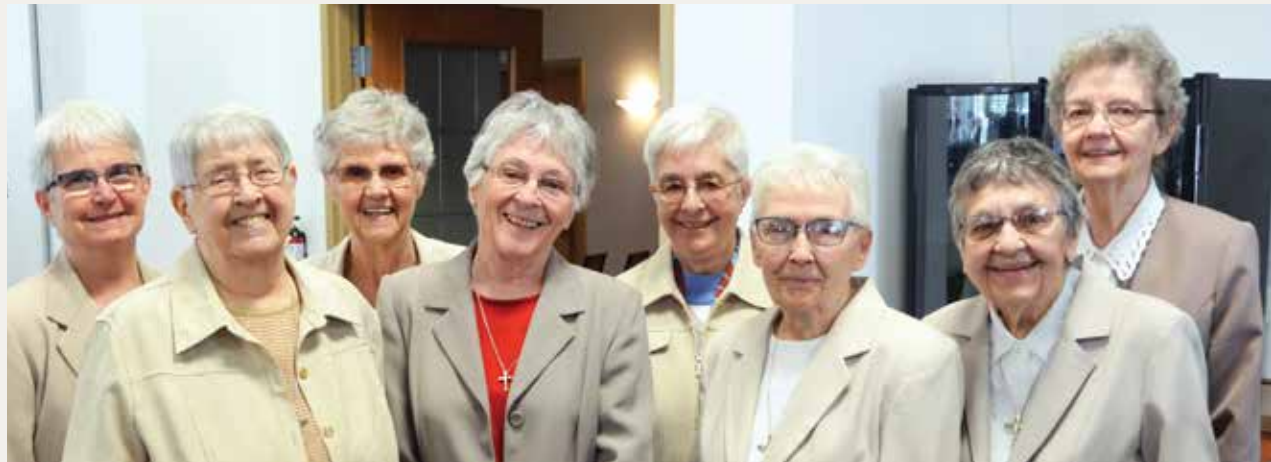
Right: Sisters of Charity of Montreal (the Grey Nuns)