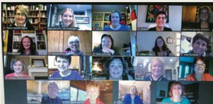
Class of 1975

Each of these classes hosted virtual reunions in October 2020. The reunions had visitors from all over Canada as well as the United States and London, England.