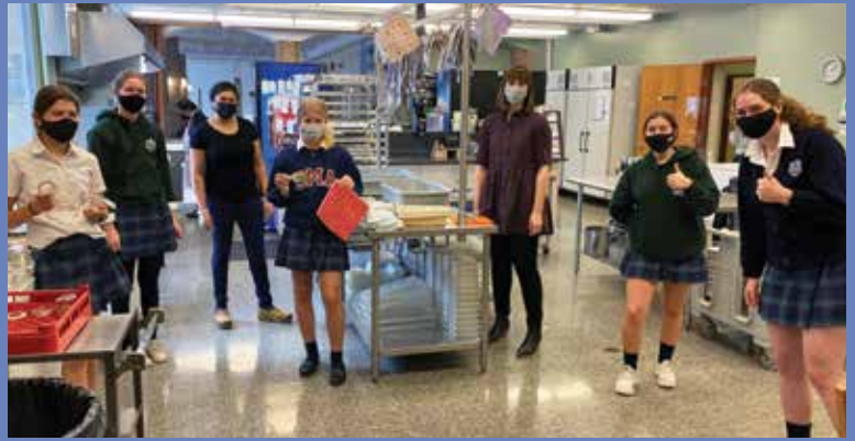
Making beeswax wraps