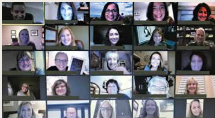
Class of 1990