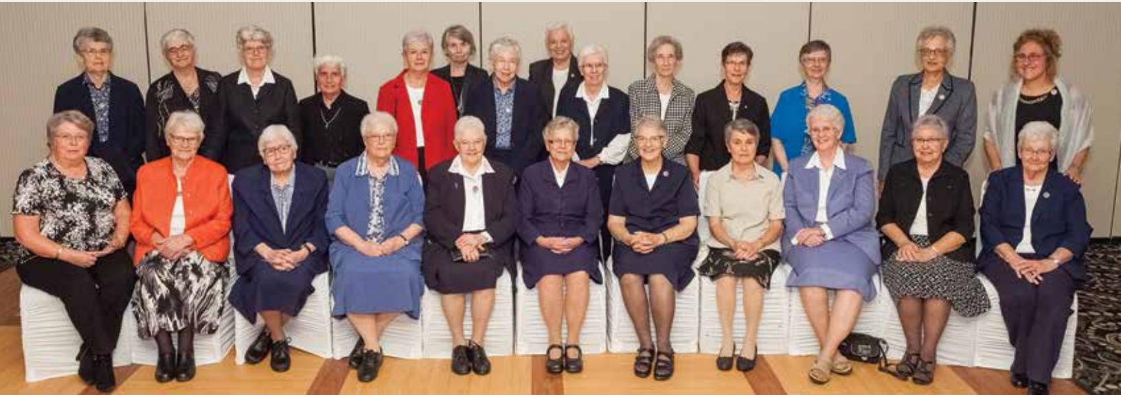
Top: The Manitoba Community of The Sisters of the Holy Names of Jesus and Mary

The Manitoba 150 Women Trailblazers recipients were announced on January 28, 2021, the 105th Anniversary of most Manitoba women being the first in Canada to receive the right to vote. St. Mary's Academy was honoured to have many members of our community receive the award. Congratulations to recipients and nominees.